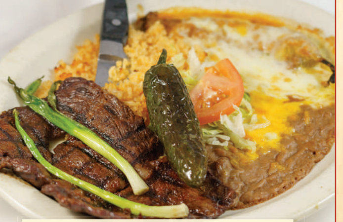
Asada y Mas - 18.50 Fillets of skirt steak, char-broiled and garnished with whole green onions and served with your choice of enchilada, chile relleno or tamale.