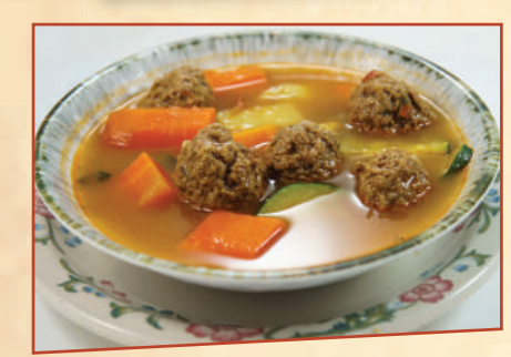
Albondigas Soup Cup 6.50 - Bowl 9.50 A Delicious Mexican soup made with meatballs and vegetables.

Caldo de Camaron - Bowl 16.75 Soup filled with shrimp, potatoes, carrots, and zucchini served with your choice of tortillas, crackers or tostadas. Add Fish for 4.00