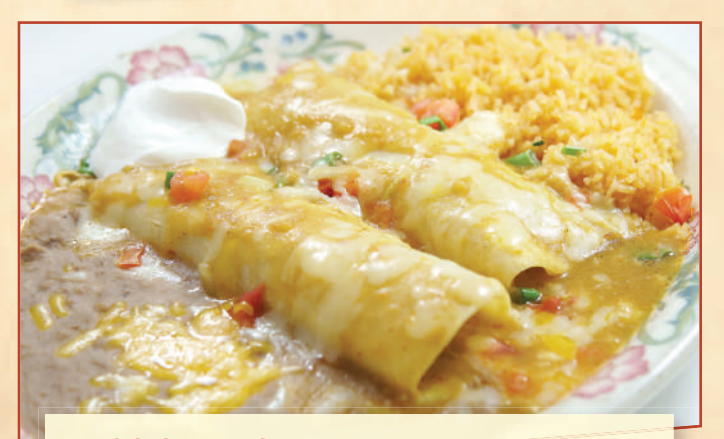
Enchiladas Rancheras - One 8.20 - Two 10.20 Corn tortillas filled with your choice of chicken, picadillo, ground beef or cheese. Topped with onions, green peppers, tomatoes, jack cheese, a ranchera sauce and garnished with sour cream.

Enchilada Suiza - One 8.20 - Two 10.20 Corn tortillas stuffed with your choice of filling, topped with delicious green tomatillo sauce, melted jack cheese and garnished with sour cream.