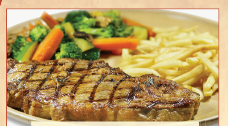
Ribeye - 23.95 Our 16 oz. Ribeye is grilled to your liking, served with your option of fries, steamed vegetables, rice & beans or salad.