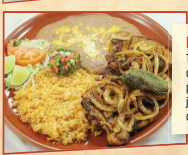
Pork Carnitas - 14.75 Boneless chunks of pork seasoned and slow cooked until tender. Served with Pico de Gallo, rice and beans. Enjoy with lime and salsa and your choice of corn or flour